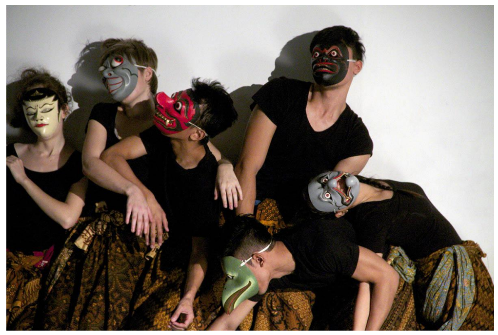
ITI students performing traditional Indonesian theatre Wayong Wong